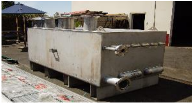
Solar Thermal Storage