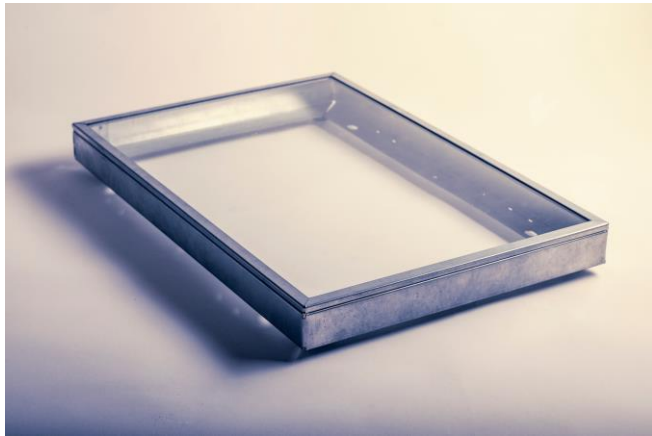
Single piece of folded steel