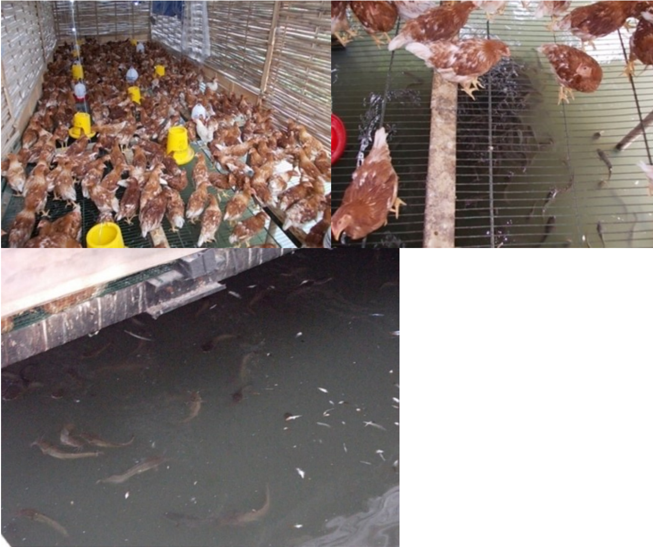
Grey-black of water color

I have success in water sanitation by Euchornia crassipes for drinking about 800 hen layers. Water source are contaminated by feces