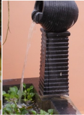
Water pump used for cycles and oxygen adding