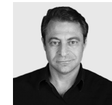
Peter Diamandis Co-Founder